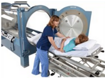
Model 3600H Hyperbaric Chamber

Prisma Health Midlands has plans to develop, build and optimize a specialized wound healing and hyperbaric oxygen center to advance current wound treatment in the Columbia area. This investment would expand access to hyperbaric treatments at two to three times the current access rate, reducing diabetic limb amputations and the loss of lives.